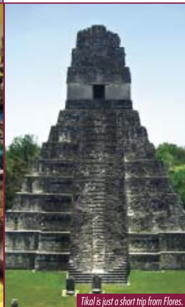
Tikal is just a short trip from Flores.