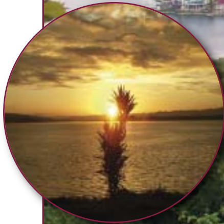
Our school in Guatemala is located in a beautiful centre of the small town of Flores.

The idyllic island of Flores, in the midst of Guatemala's Lake Petén Itzá, is a tropical dream just waiting to be discovered.