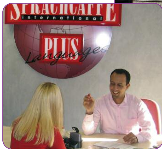
Düsseldorf offers you an ideal environment for concentrating on academic success.

Dating back to 1159, the capital of North Rhine-Westphalia is a flourishing commercial centre and the fashion capital of Germany.