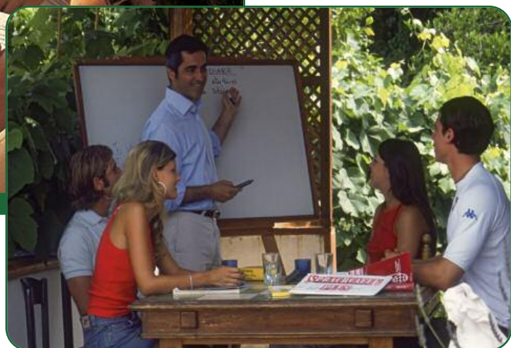
Calabria – learn Italian next to beautiful beaches and interesting remains of ancient cultures.

Capo Vaticano is situated on the Tyrrhenian coast of Calabria (Southern Italy), just about 3 km from Tropea.