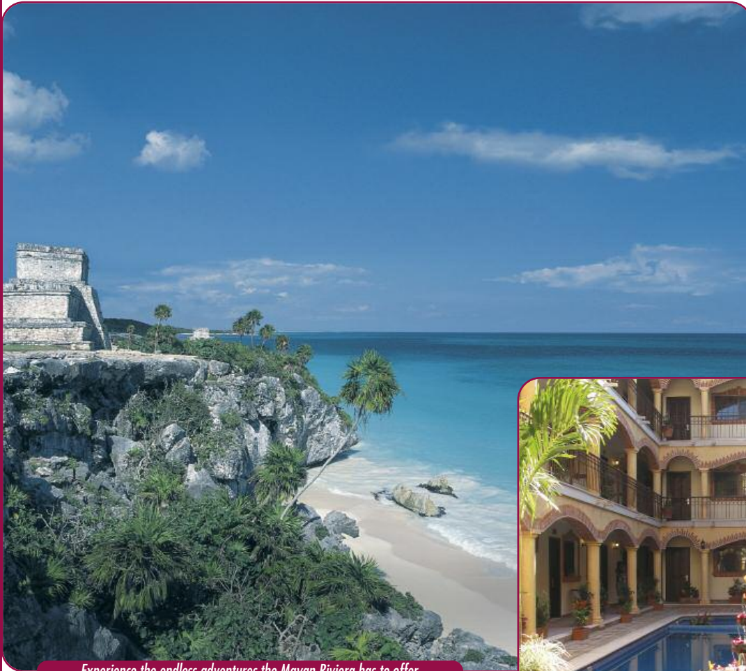
Experience the endless adventures the Mayan Riviera has to offer.

Playa del Carmen is blessed with miles of unspoiled white sandy beaches and crystal-clear Caribbean waters, which is proving harder and harder to find.